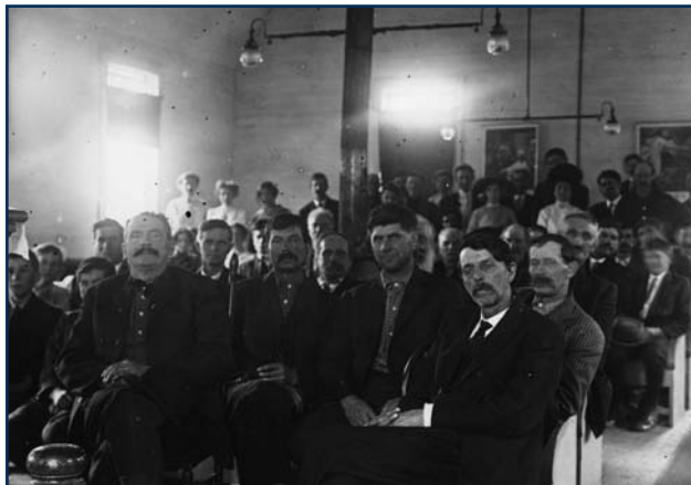
Farmers attend an event sponsored by the WVU Agriculture Experiment Station, circa 1913.