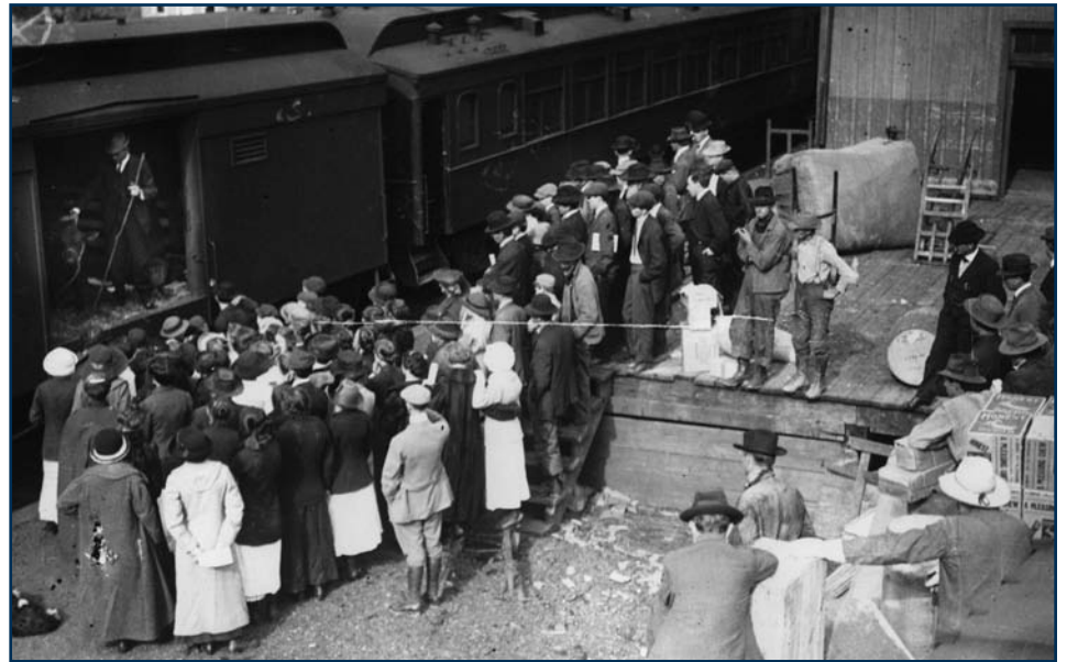
A crowd gathers to view a calf aboard WVU's Agriculture Train, circa 1913.