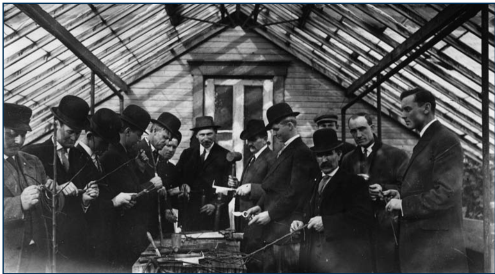
Members of WVU's agriculture faculty teach a class on grafting and budding at the Agricultural Experiment Station, circa 1913. More than a century's work at the Experiment Station is preserved through the Agriculture Network Information Center (agNIC). Learn more inside on page 3.