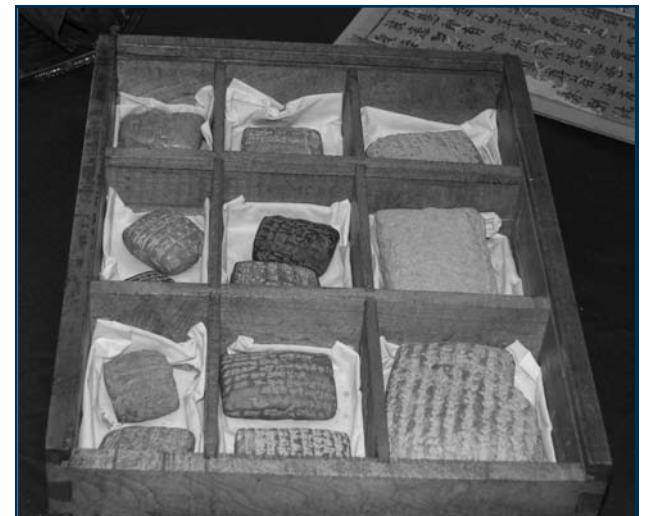
A collection of clay tablets from Mesopotamia are among several unique items preserved in the Rare Book Room.